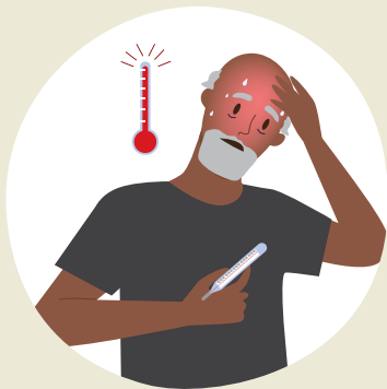
Fever (Temp over 37.5°C)

Elders and anyone with existing health condition/s such as diabetes, heart and lung problems are at high risk of getting sick and needing hospital if they get COVID-19.